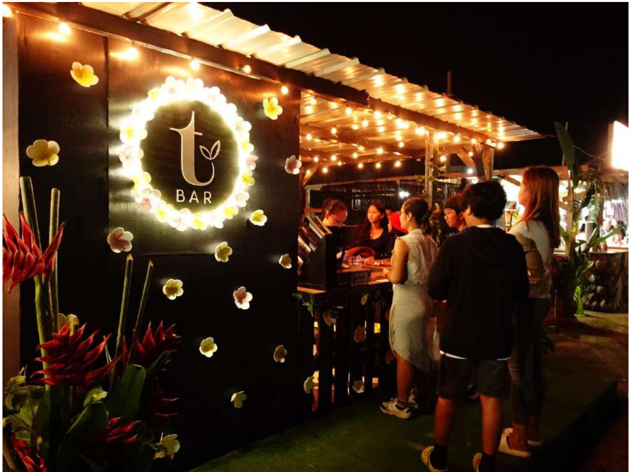
T Bar tantalizes the taste buds at the 25th Annual Taste of The Marianas International Food Festival on May 4, 2024, in Saipan, The Marianas. The festival will be held every Saturday evening during May Marianas Tourism Month at American Memorial Park, featuring food and drinks, live entertainment, nightly contests, arts and crafts, and more.