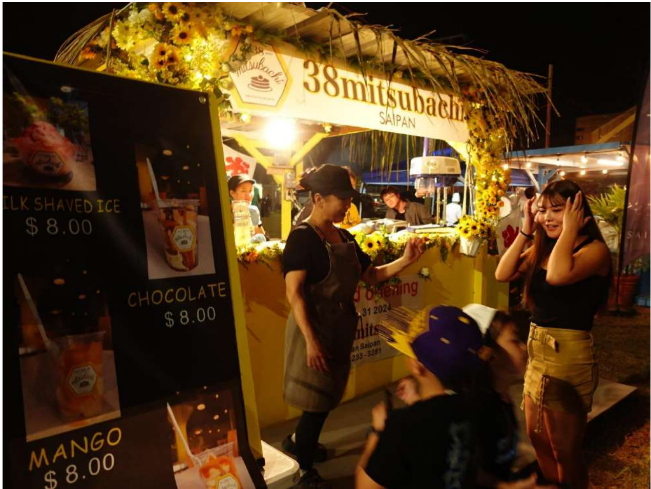
38mitsubachi welcome patrons during the 25th Annual Taste of The Marianas International Food Festival on May 4, 2024, in Saipan, The Marianas. The festival will be held every Saturday evening during May Marianas Tourism Month at American Memorial Park, featuring food and drinks, live entertainment, nightly contests, arts and crafts, and more.