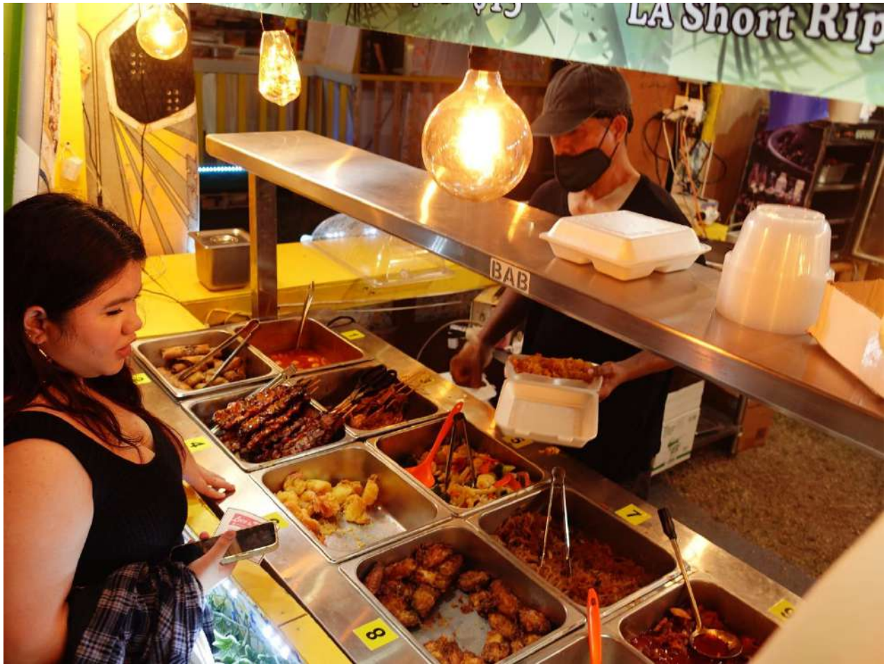
Cup Bab offers Korean cuisine at the 25th Annual Taste of The Marianas International Food Festival on May 4, 2024, in Saipan, The Marianas. The festival will be held every Saturday evening during May Marianas Tourism Month at American Memorial Park, featuring food and drinks, live entertainment, nightly contests, arts and crafts, and more.