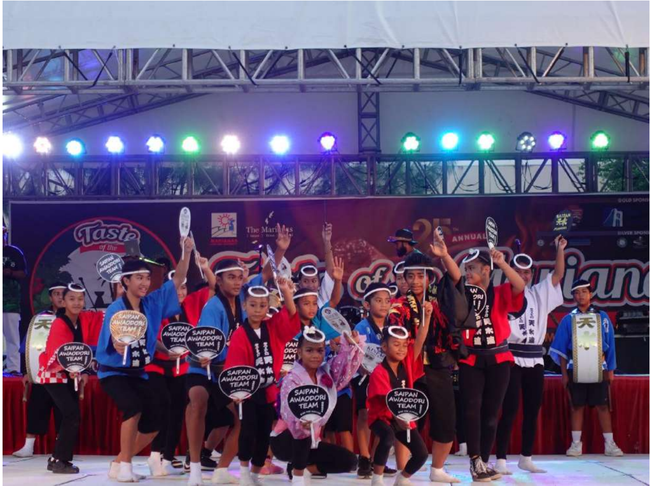
Saipan Awaodori performs at the 25th Annual Taste of The Marianas International Food Festival on May 4, 2024, in Saipan, The Marianas. The festival will be held every Saturday evening during May Marianas Tourism Month at American Memorial Park, featuring food and drinks, live entertainment, nightly contests, arts and crafts, and more.